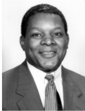
CHIEF CHARLES MOOSE, PhD Montgomery County Police Department