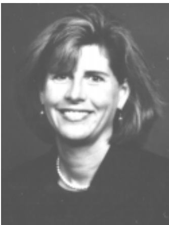
KAY BALDWIN Chief U.S. Department of Justice Civil Rights Division Employment Litigation